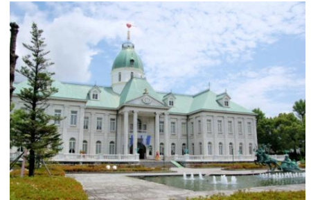
The exterior has been used in TV and Movies

Everyone has dreamt of visiting a house made entirely out of candy, but at the Sweet Castle (Okashi No Shiro) you can have the next best thing. This unique building in Inuyama, Aichi has been a local attraction for almost 30 years and is undeniably the sweetest place in Aichi.