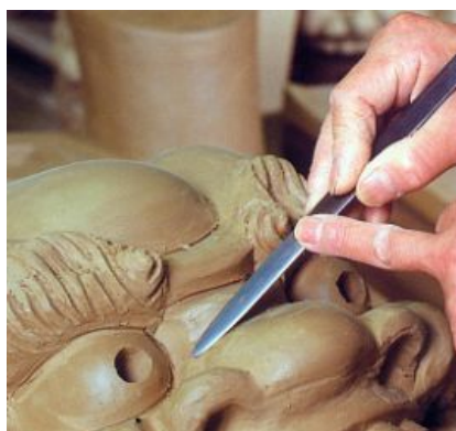
A goblin tile comes to life in Takahama City

shops. In a country that is always eager to modernize, traditional tiles are a charming reminder of thousands of years of history that have served as the building blocks of today's society. As the first line of defense for dwellings that, despite their seeming fragility with their thin wooden walls and paper doors, stand up to typhoons, snowstorms and rainy seasons year after year, traditional roof tiles' aesthetic beauty is deeply linked to their functionality.