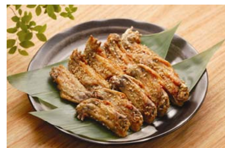
Buffalo wing addicts, meet Nagoya tebasaki

Sushi and sashimi are all well and good, but a few days into your next trip to Japan you may find yourself hankering for the comfort of a greasy American meal. While they certainly enjoy their share of typically healthy Japanese cuisine, Nagoyans are also not afraid to clock up some calories once in a while, and domestic tourists are sure to seek out the local deep fried dishes when they make it to the city. For Americans, these dishes provide that brick-in-your-stomach sensation that we are so fond of while still being distinctive enough not to jeopardize our pledge to be adventurous eaters.