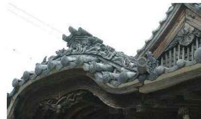
Decorative tiles adorn a Takahama temple

Should you feel inspired to try a little sculpting of your own, spend a relaxing half-day in the Kawara Museum's pottery facility where ¥1000 ($9) gets you a kilogram of Takahama clay and hands-on instruction for turning the latent lump into a one-of-a-kind creation.